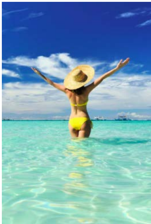
CRUISING AREA: Turkey