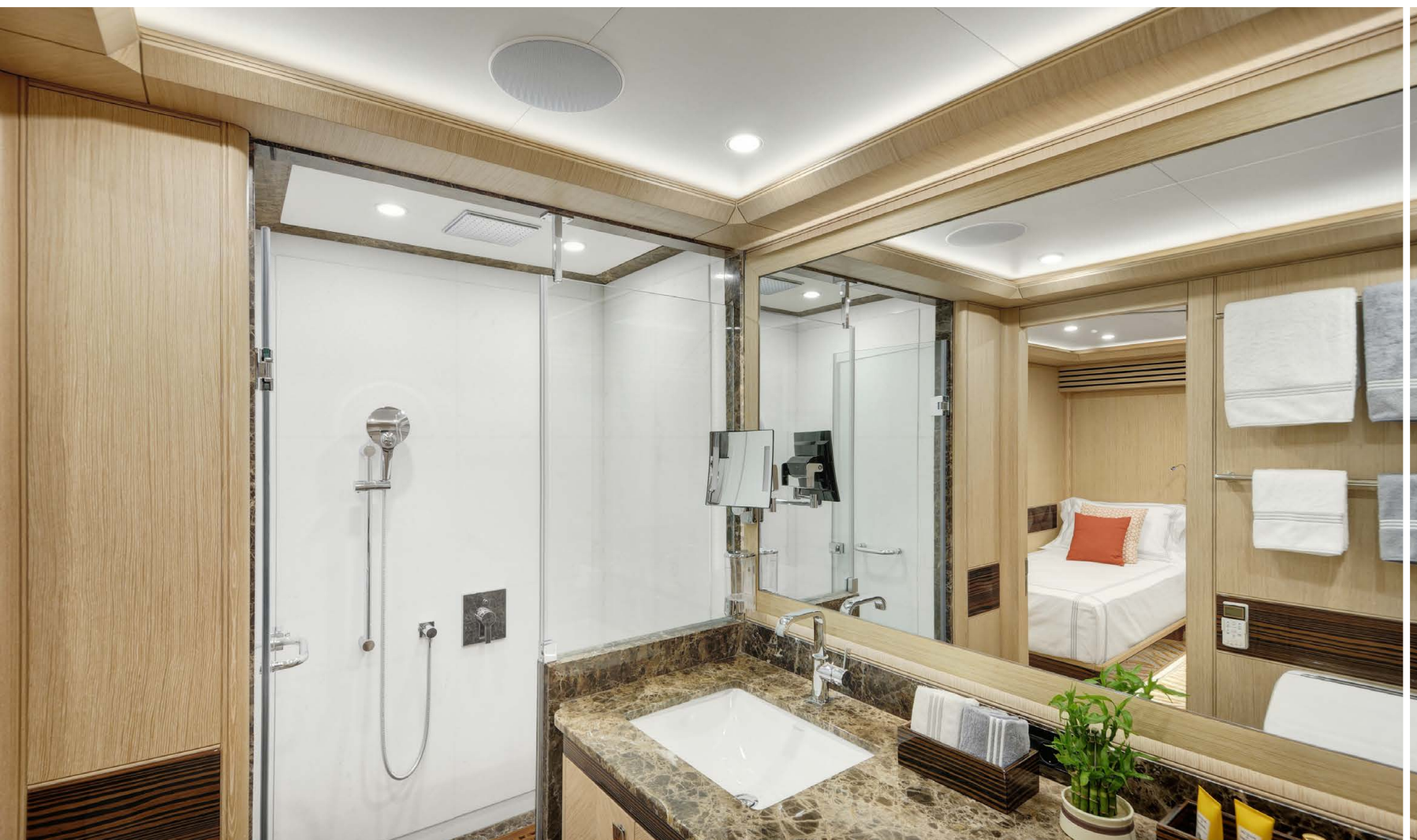
TWIN CABIN BATHROOM