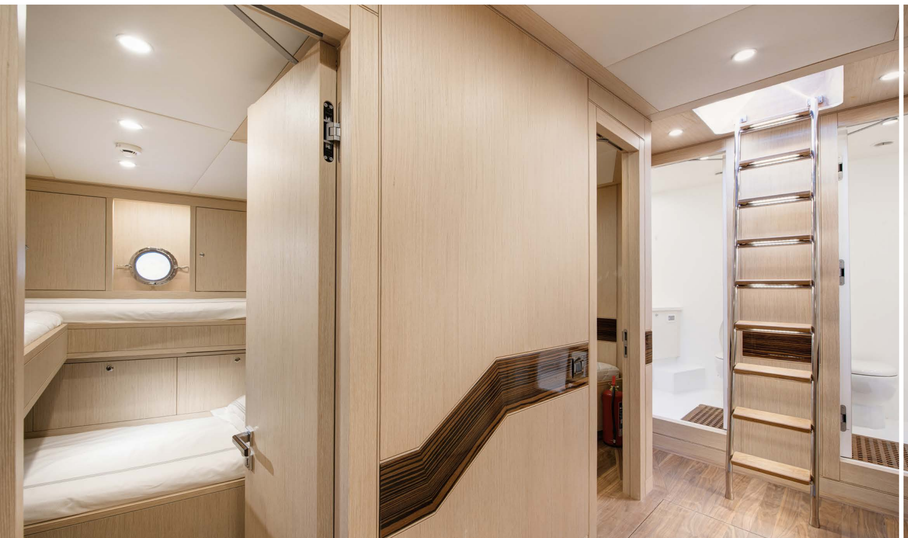
CREW CABIN AREA