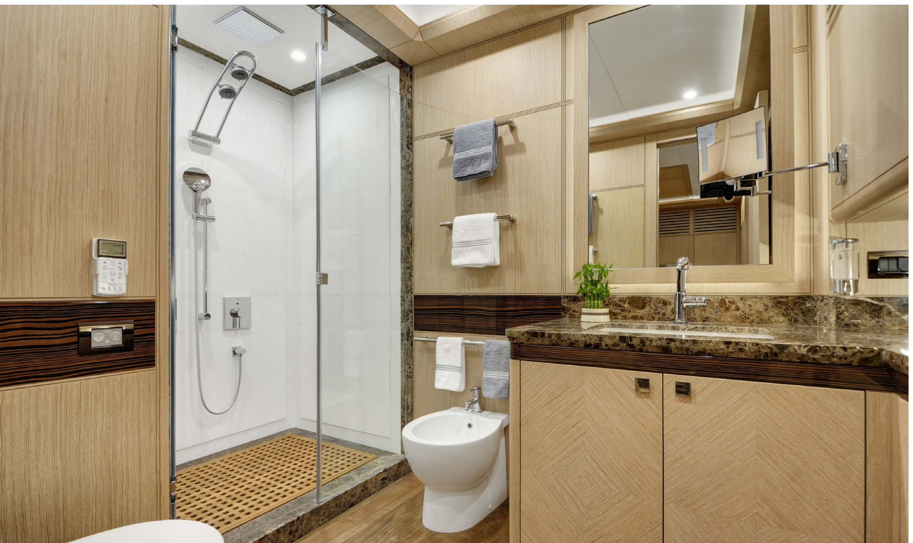
VIP CABIN BATHROOM