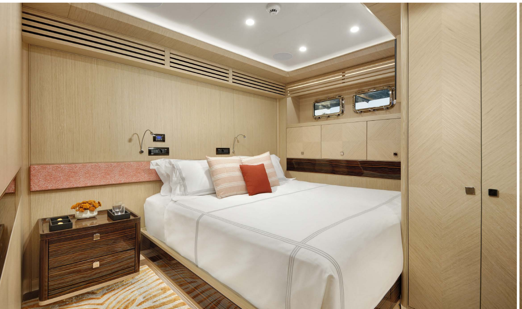
TWIN CABIN CONVERTED TO DOUBLE