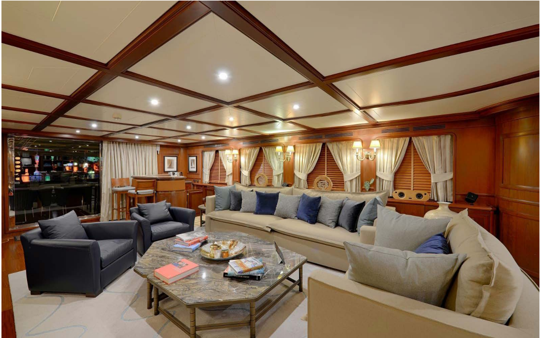
Main Saloon & Dining Area