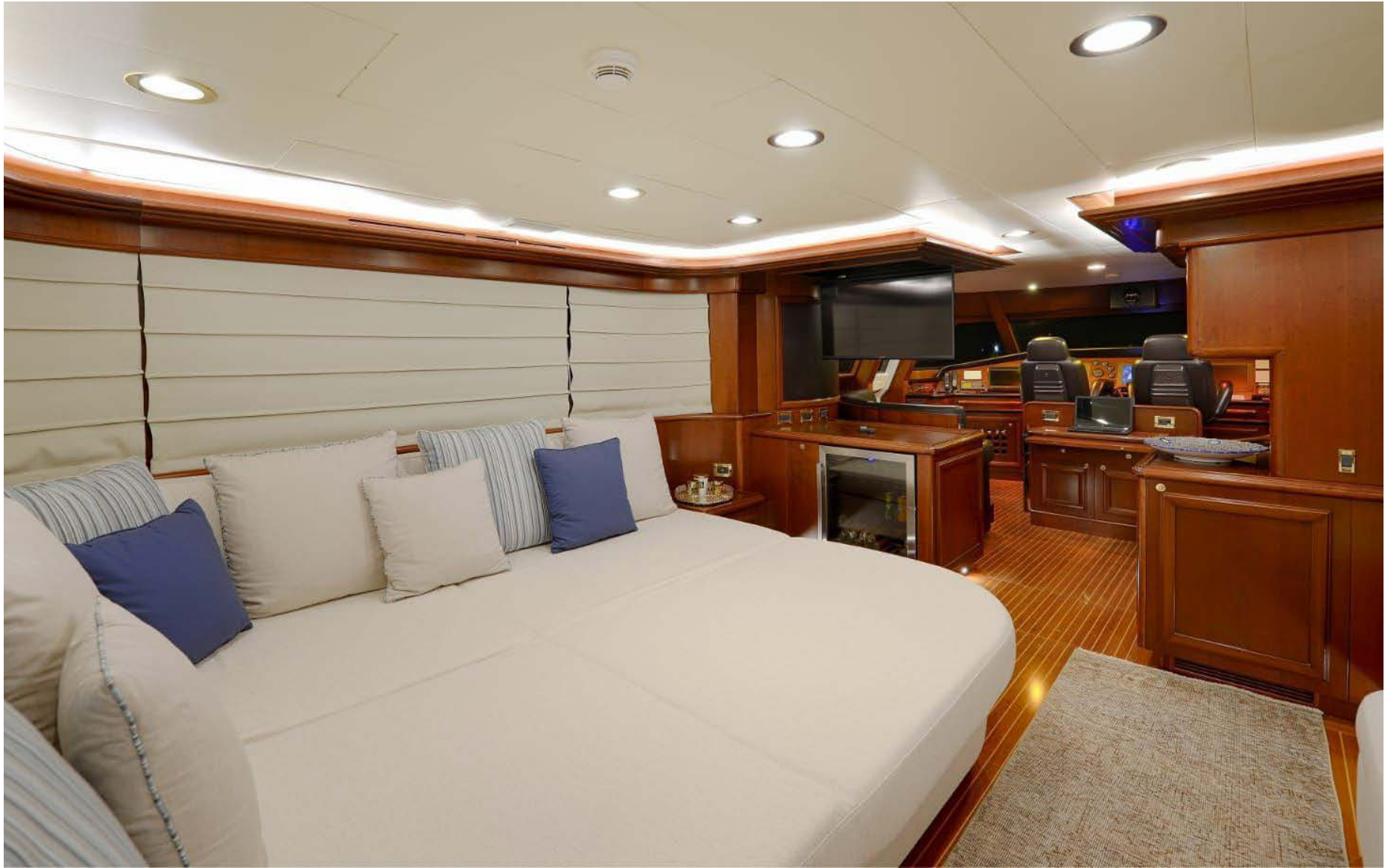
Upper Lounge & Helm Station