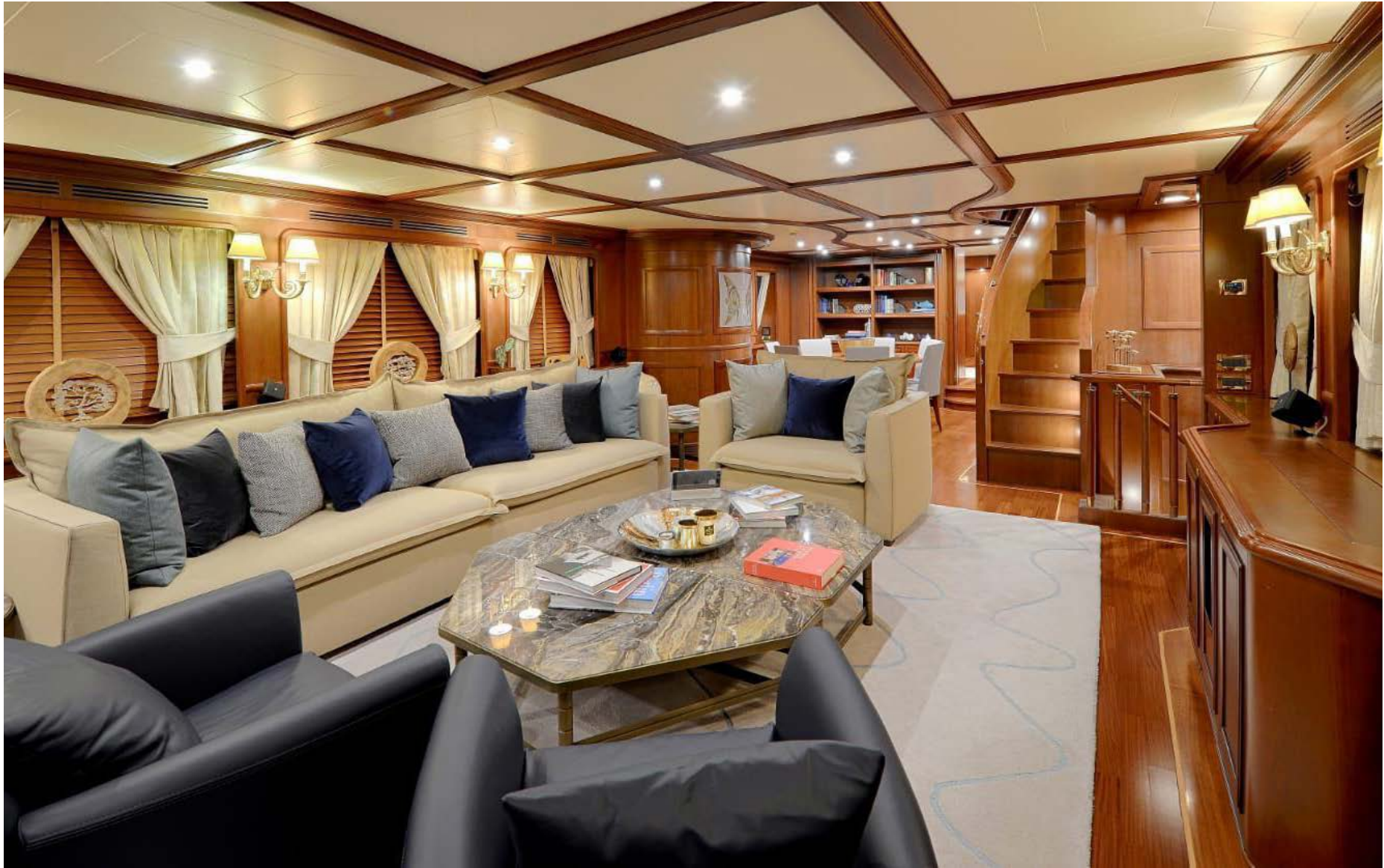
Main Saloon & Dining Area