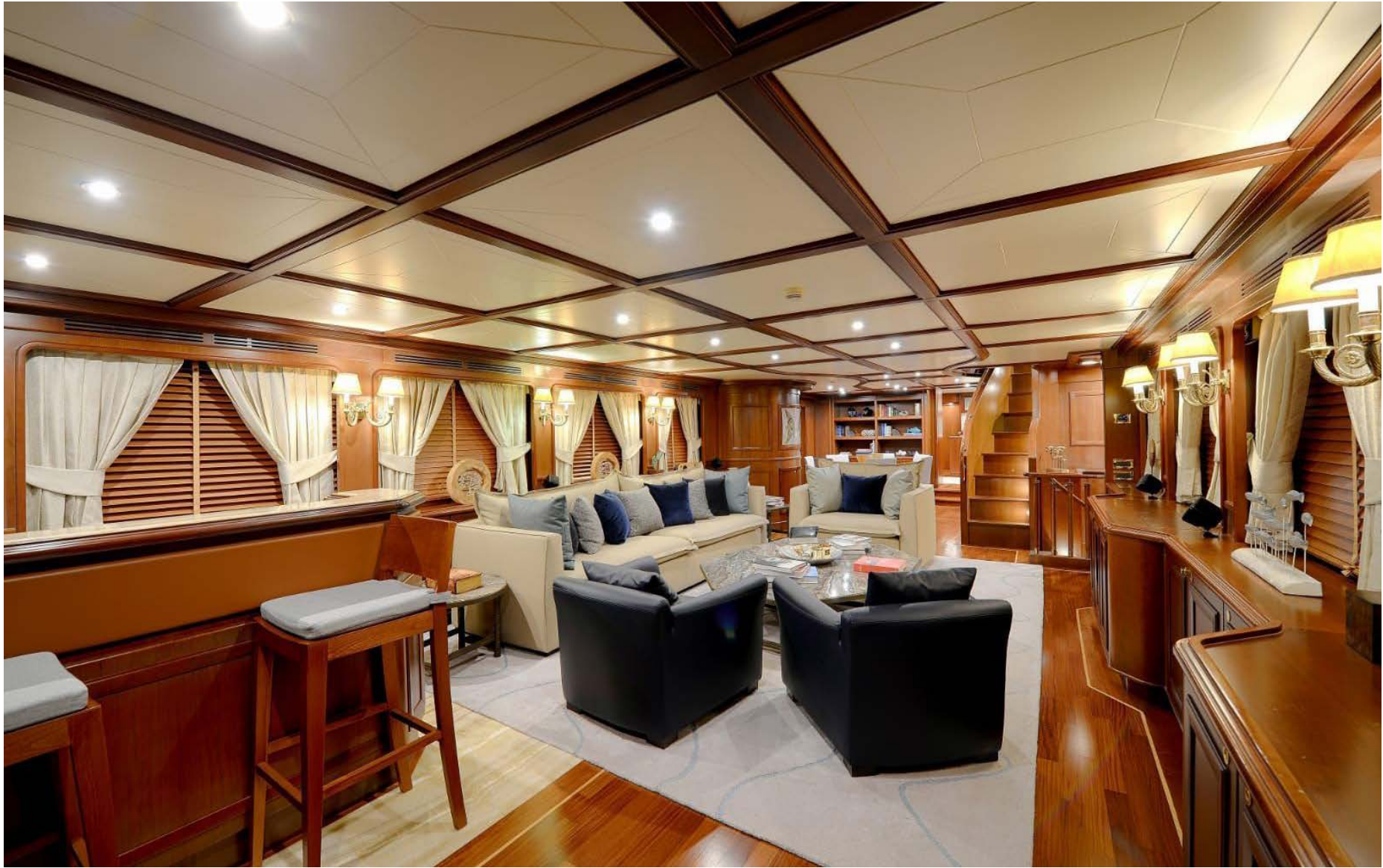
Main Saloon & Dining Area