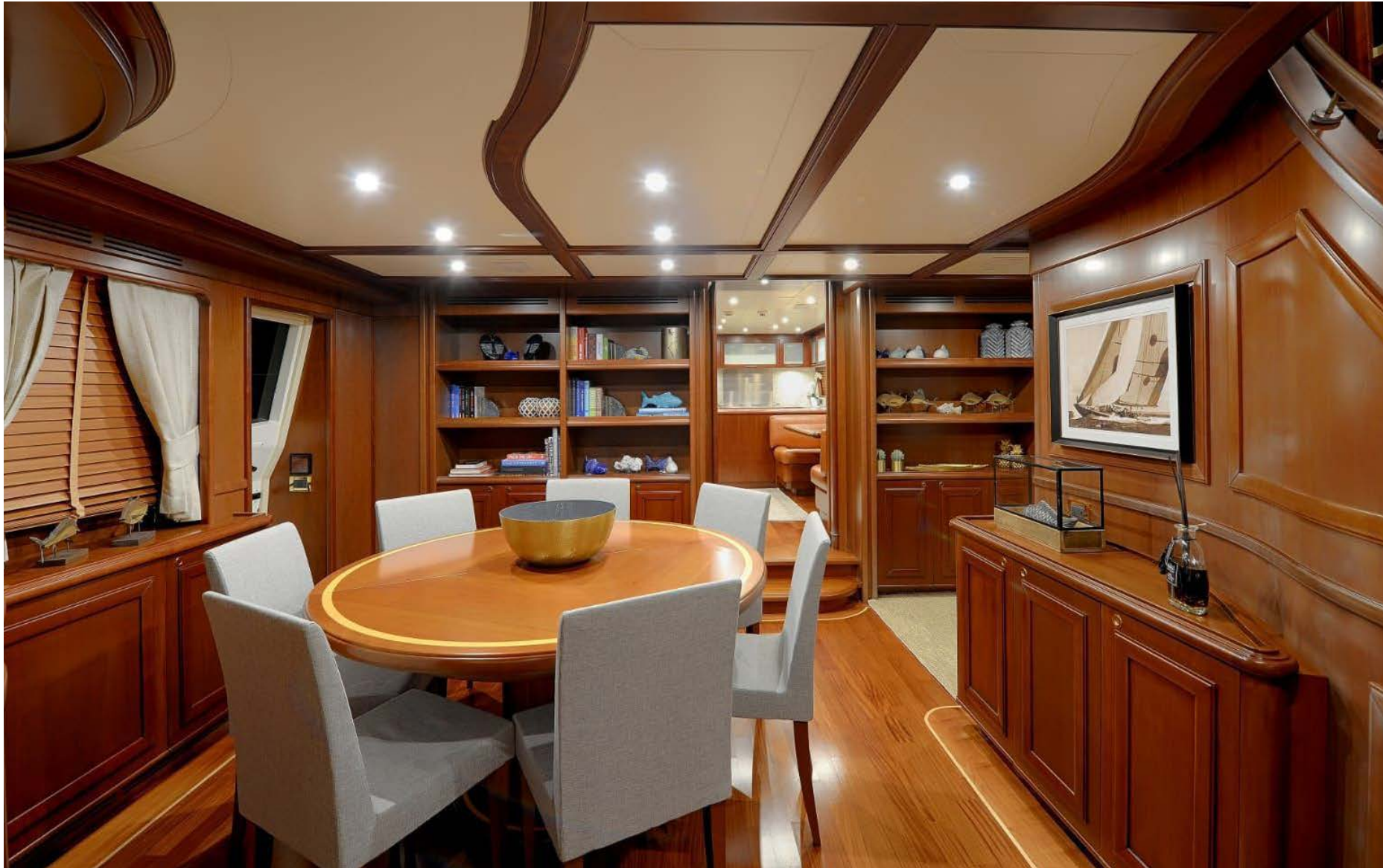
Main Saloon & Dining Area