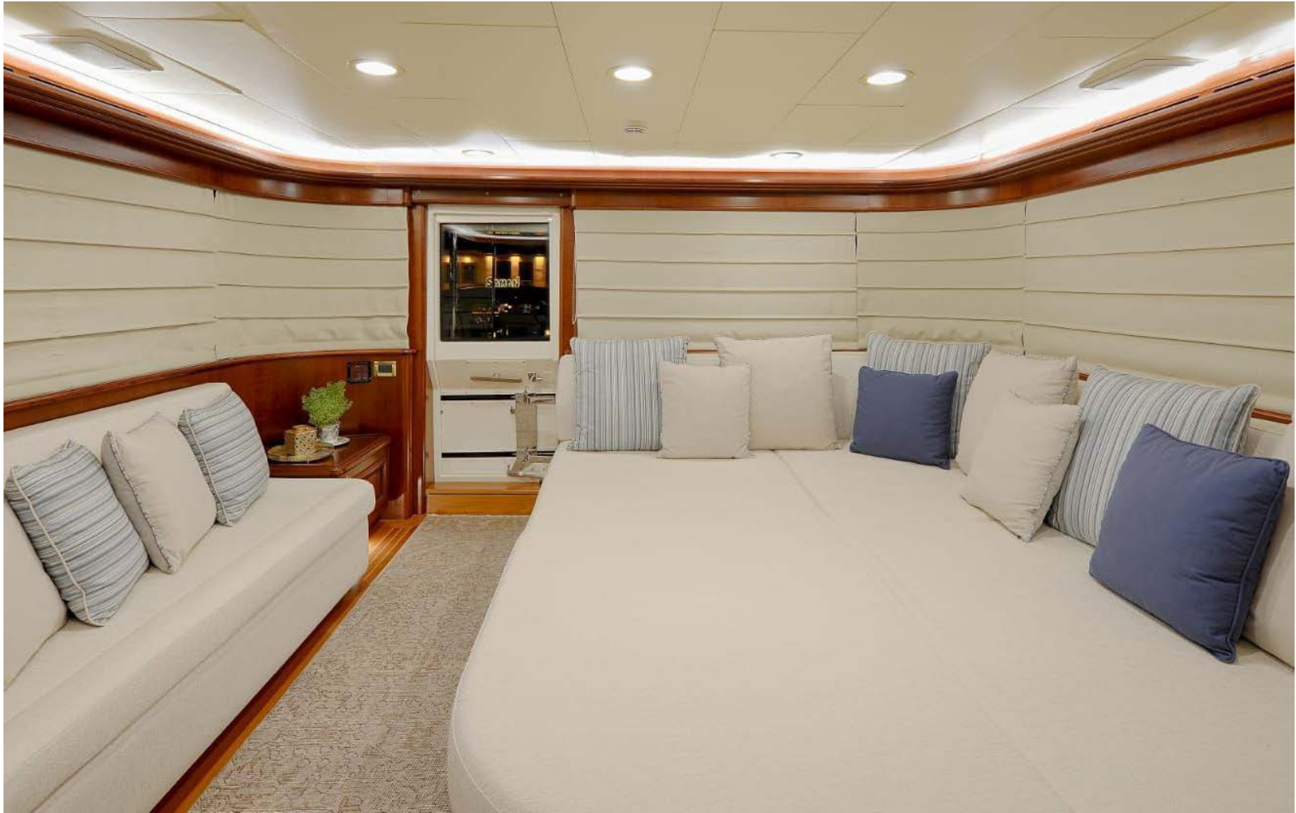
Upper Lounge & Helm Station